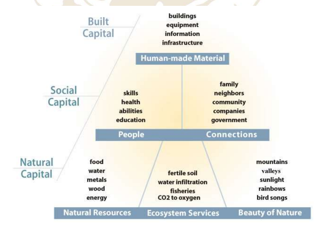
Fig 1. Nature Tourism – Capital Chart

(i) Nature tourism is the travel through and enjoyment of the natural world, its seasonal cycles and events, carried out in a manner that promotes the protection of natural and human communities. Community leaders, public officials, agencies, and others who are interested in sustainable nature tourism will find tools to get started and links to other helpful information. A sustainable nature tourism industry is directly related to the type, amount and quality of natural capital in community.