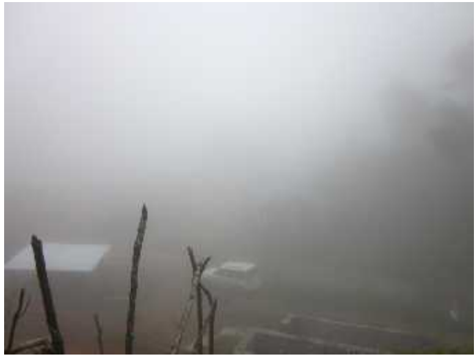
PARAOLON VILLAGE SHROUDED IN A THICK MIST

We were hailed through the mist by a man's voice. Dimly, we could make out some soldiers up a slope. We were told to come up, so one of our team members clambered up to talk to the soldier.