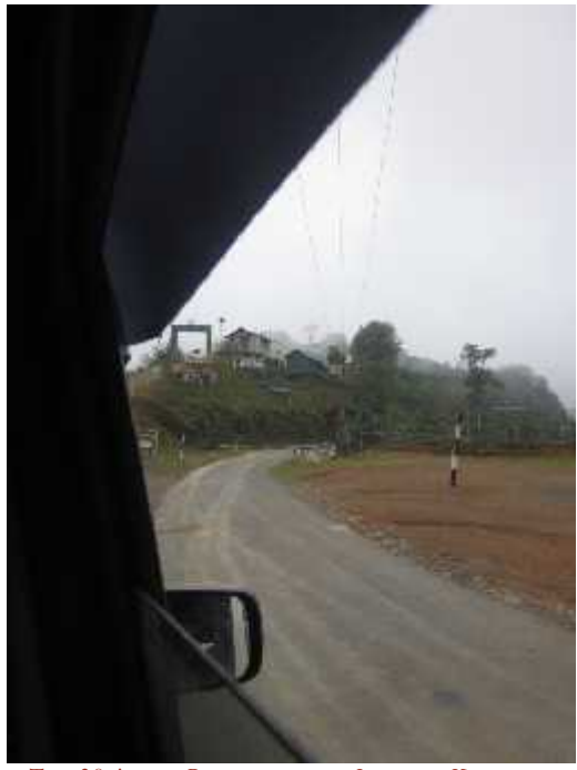
THE 20 ASSAM RIFLES GATE AT LARONG KHUNOU

the team met with Assam Rifles personnel of its 20<sup>th</sup> Battalion based there. We were halted at the closed gate. After providing them with the necessary information, which was cross-checked over the radio, we were allowed to go further. We did not see or meet any villagers at Larong Khunou; all along the long snaking metalled road in relatively good condition, we were met with silence and abandoned locked down houses.