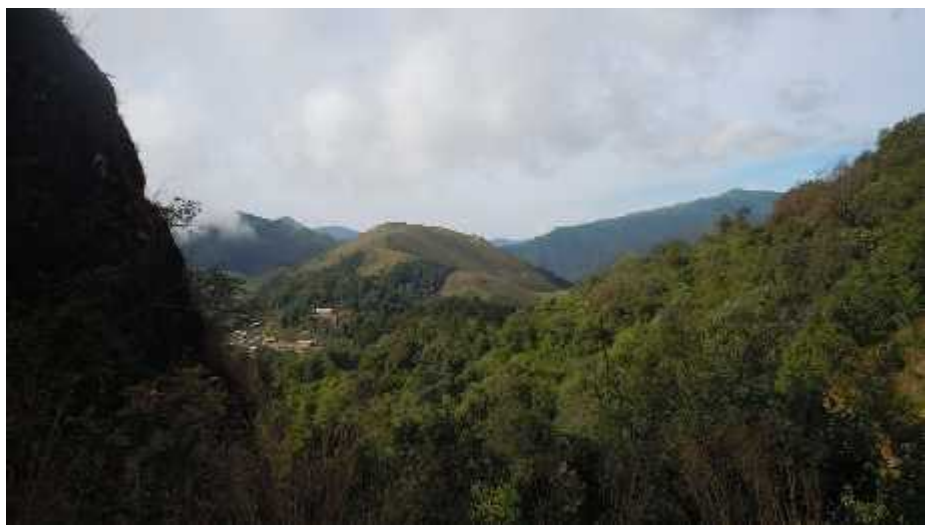
View of a Myanmar village from Kotal Khunthak in Chandel District near Paraolon

We saw an old woman heading back with her dog towards Challong on the road, and she quickly turned away as she heard our vehicle approaching. We reached Tamu just before 03:00 PM after completing formalities with the police station and the immigration check at the border in Moreh. In Tamu, we met with local civilian and sources regarding any information on the whereabouts of the villagers and tried to gather some news about the reported cross border army's special operation strike after the ambush. Here too, we had to leave the place empty handed. We were told that no Indian army operation took place in Myanmar and that there were no casualties reported.