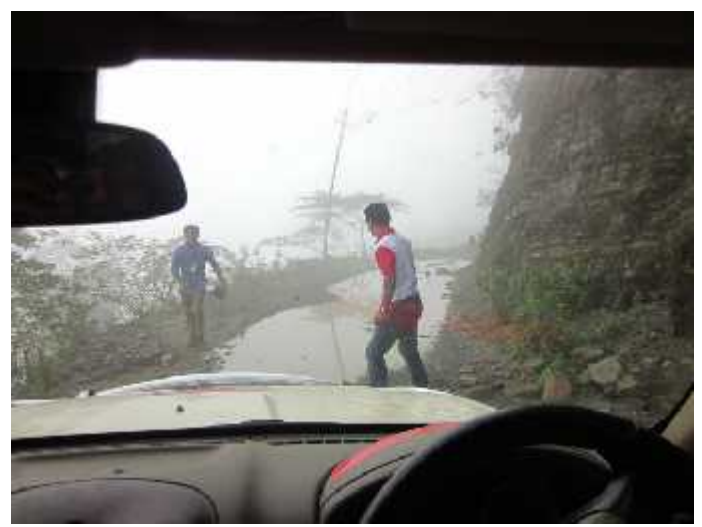
THE ROAD HAD BE CLEARED BY HAND; THICK MIST REDUCED VISIBILITY

The road in this section was very rough, with large water-filled potholes and rocky, landslide debris. Huge stones had to be removed physically before we passed.