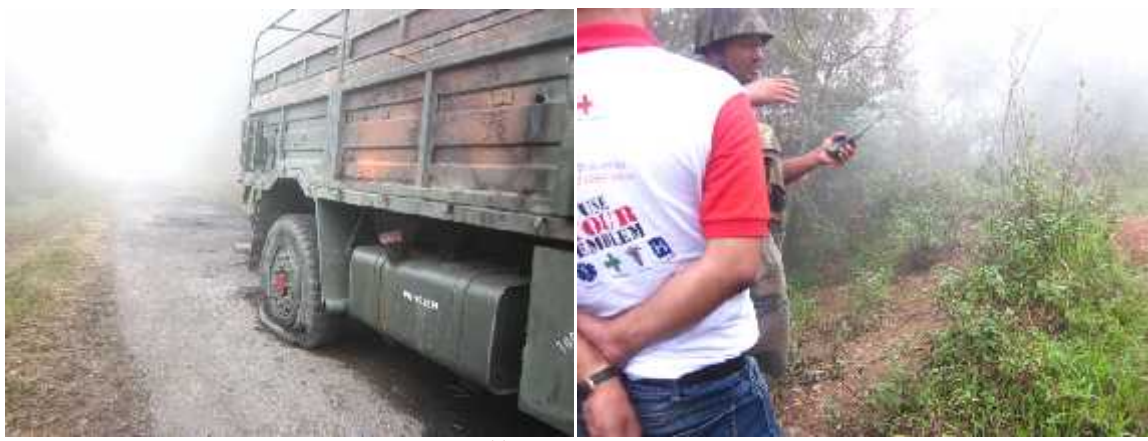
The ambush site

We could not proceed further, and left Paraolon Village at around 01:00 PM heading for Moreh Town on the international border, and Tamu, the district administration town in Myanmar across the border from Moreh. It rained all the way up to Tengnoupal and heavy mist covered the entire area. We were stopped again at the ambush site. After identifying ourselves, a friendly Dogra Regiment soldier was only too pleased to recount what exactly had happened on that fateful day on 4<sup>th</sup> June.