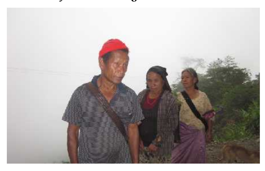
June 15, 2015 Disaster Relief Committee Manipur and Indian Red Cross Society, Manipur State Branch

Report of the Preliminary Fact Finding and Needs Assessment, 13 June 2015