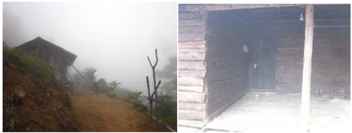
ABANDONED HOUSES IN PARAOLON VILLAGE

Our purpose of the visit was to assess the situation and also to assess the villagers affected by the incident. Two empty community water tanks remained abandoned. The houses had planted passion fruit vines, lemons and other fruit trees around the houses. Ripening passion fruit lay rotting on the ground. The soldiers said they did not know where the villagers had gone.